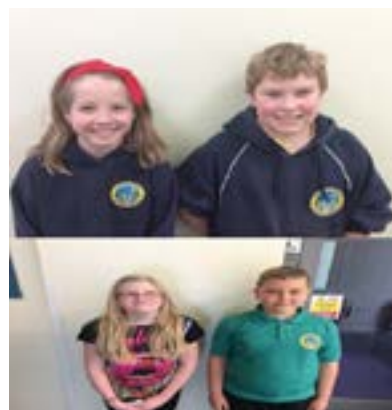
Meet the Sports Ambassadors