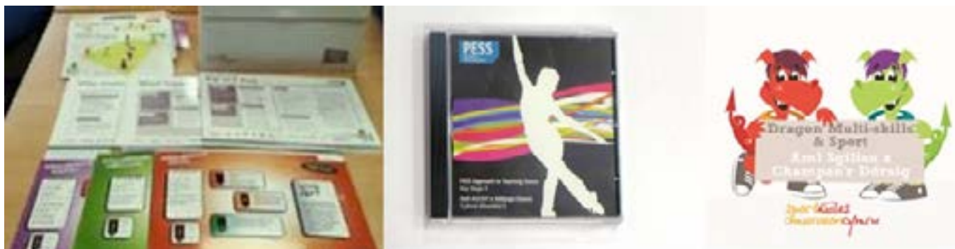
Examples of the training resources used and delivered during the staff INSET days