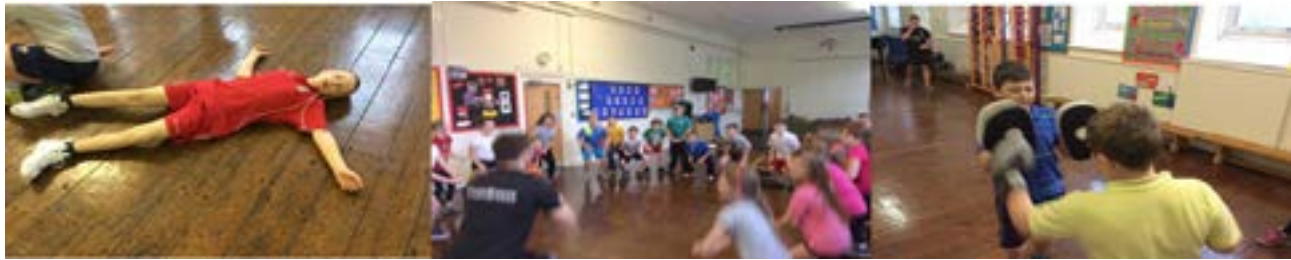
Boxing activities provided by Breeze Gym

“Awesome, lots of variety to keep us fit.”