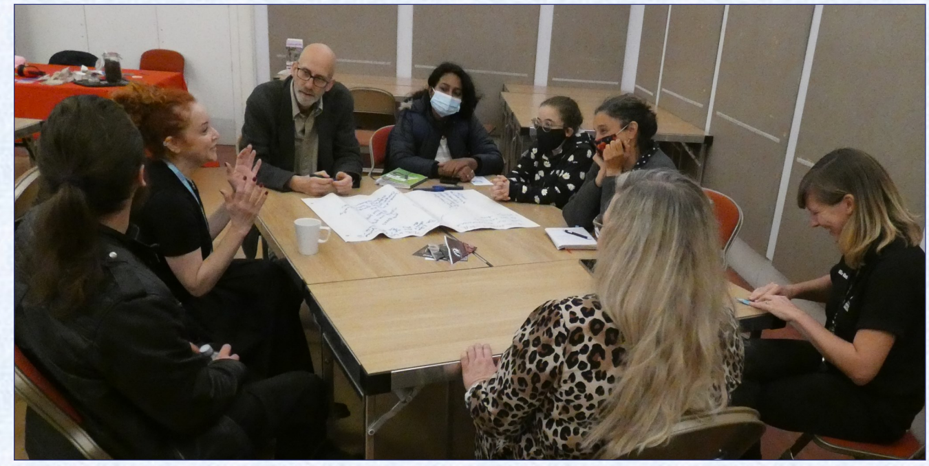
Image: Staff and students seated around a large table, engaging in group discussions around climate action.

Climate Action Day attendees contributed to a collaborative guilt project for COP26, folded peace cranes for an on-campus installation, played 'How Bad Are Bananas?' a carbon footprint myth-busting game, made seed bombs, wrote climate commitments to add to a tree of hands, and climate confessions to prompt nonjudgmental discussion around the barriers to adopting change.