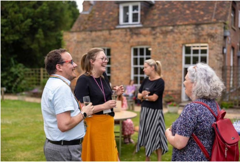
Staff volunteers at the summer celebration

School Governors play a vital role in enhancing the quality of education and shaping the future of young people in the region. As part of the School Governors' Charter, signed in 2021, we pledged to raise awareness and celebrate the impact of our staff who volunteer as school governors.