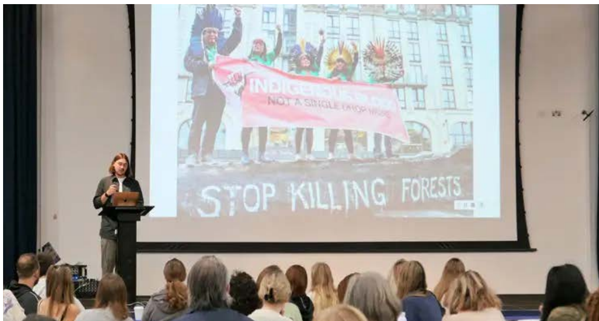
Staff, students and members of the public at Sustainable Future event

Canterbury Christ Church University marked its commitment to sustainability with a day of events focused on social and environmental justice, welcoming staff, students and the wider community, to explore social and environmental justice with workshops, activities and speakers.