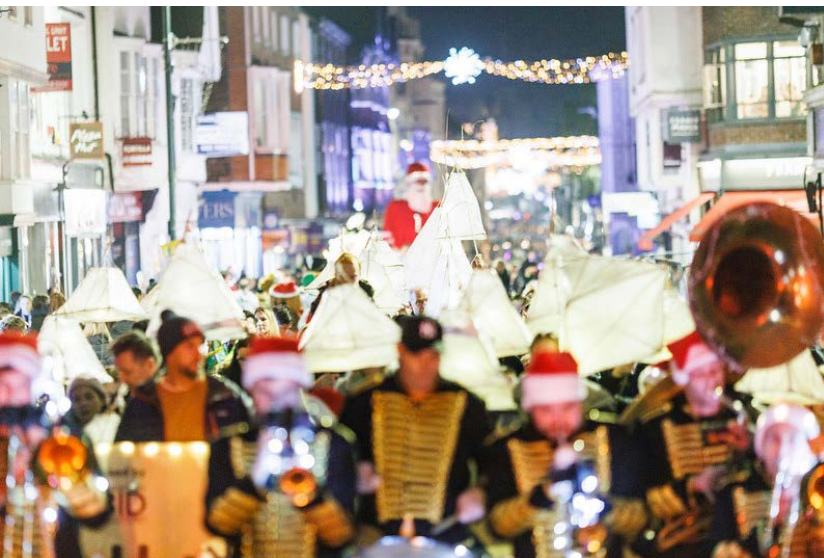
Lantern Parade

The University Arts and Culture team supported the Canterbury Christmas Parade in December 2022, by providing two free family workshops at the Beaney on 5th November that attracted 40 young families, who then participated in the parade with lanterns they had created.