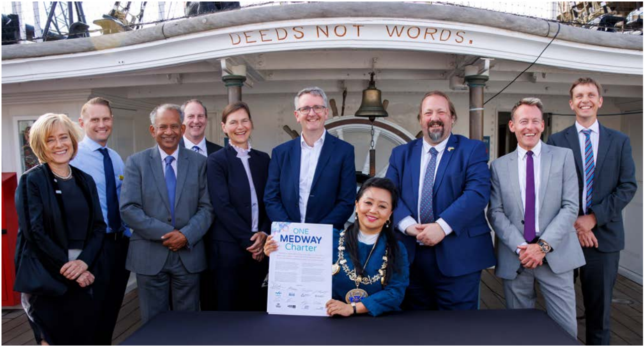
Representatives of the eight organisations signed up to One Medway Charter

Together with seven other organisations in Medway, the University signed an agreement - One Medway Charter - to drive social and economic change in the area, committing to working together to exploit opportunities and address challenges in priority areas.