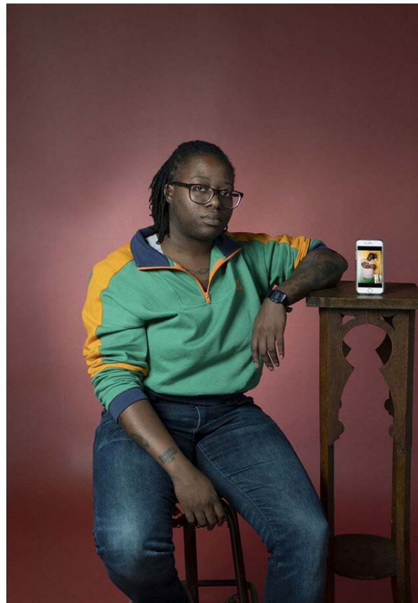
Participant in the Mourning with Tattoos workshop