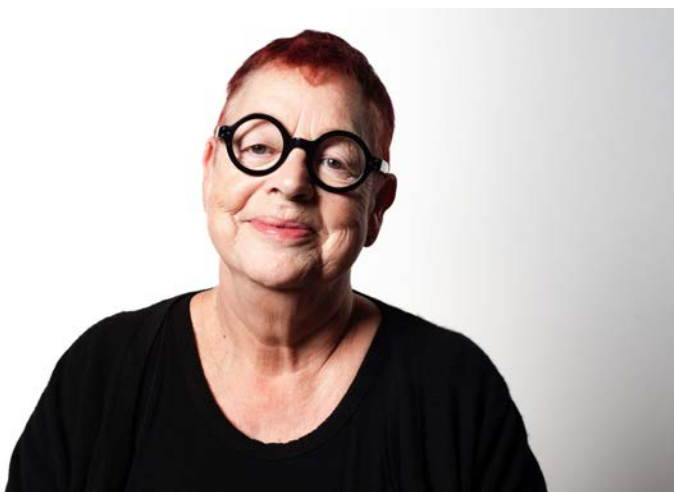
Comedian and Honorary Graduate, Jo Brand

This year we welcomed members of the public onto campus and online, to share knowledge, engage in debate and inspire new ideas. The University Public Lecture Series programme this year included comedian and Christ Church honorary doctor Jo Brand 's sell-out lecture 'Growing Old Gracelessly.'