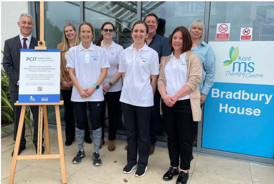
Speech and Language Therapy staff, students and graduates at the new centre

This year, a team of Speech and Language Therapy (SLT) lecturers, graduates, and students from the University have been involved in the setup of a world leading Parkinson's Centre for Integrated Therapy (PCIT) at the Kent MS Therapy Centre building in Canterbury.