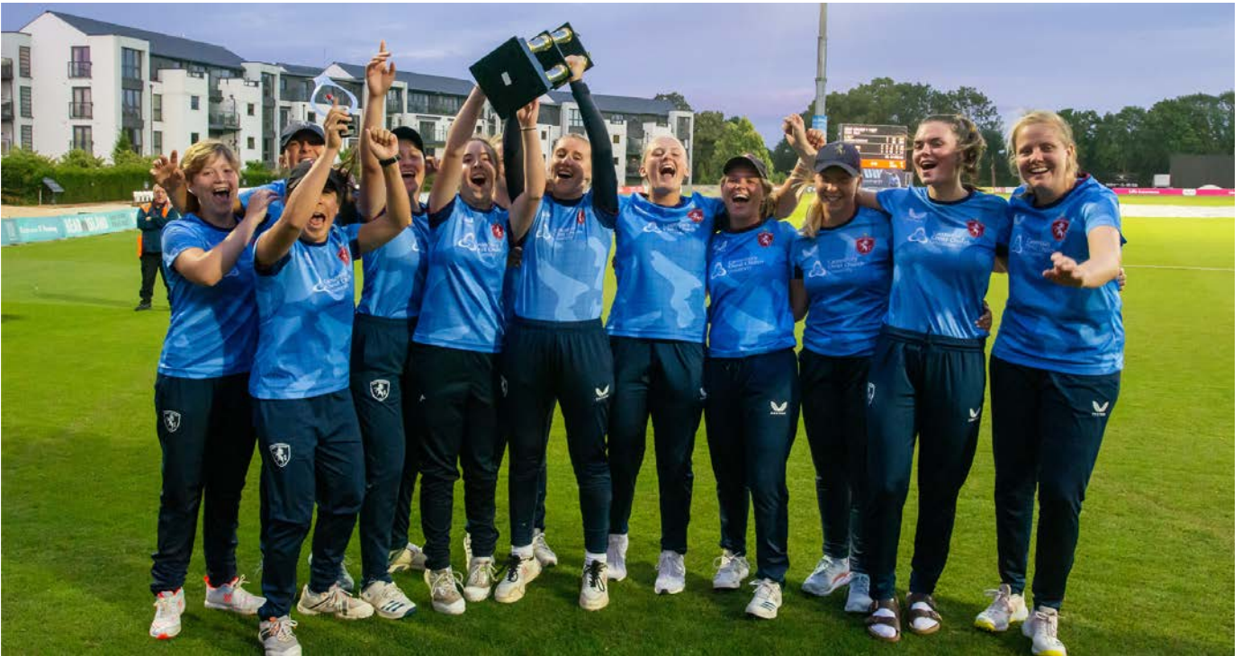
Kent Cricket's Women's Team

This year the University extended its partnership with Kent Cricket for another three years, as the Club's Women's Cricket Headline Partner.