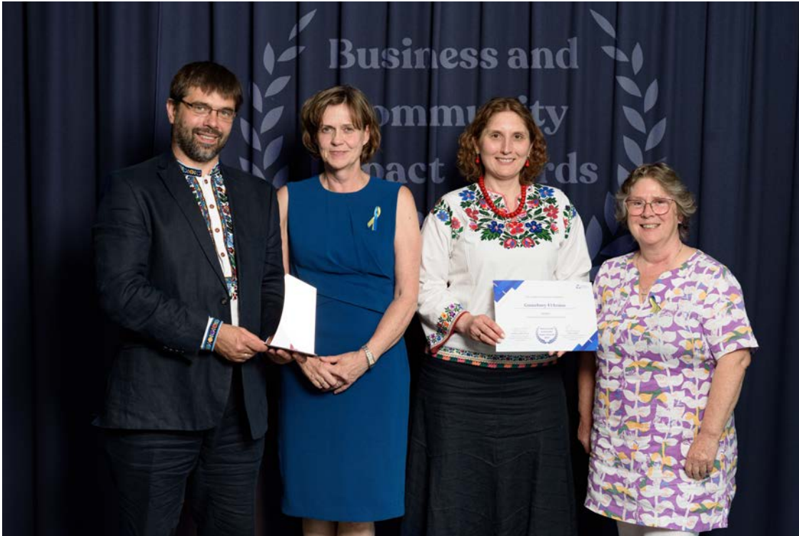
Canterbury 4 Ukraine representatives at the Business and Community Awards

Since the start of the war in Ukraine, the University has pledged to support displaced Ukrainians living in Canterbury. As part of the community consortium, Canterbury 4 Ukraine, we have provided practical support such as language lessons for adults and Arts Council funded language and cultural activities for young Ukrainian children, hosted at Simon Langton Girls' Grammar school.