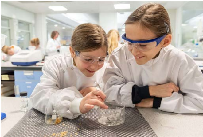
Pupils learning at the Community Lab