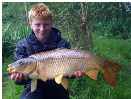
2- Enjoyment / Enrichment