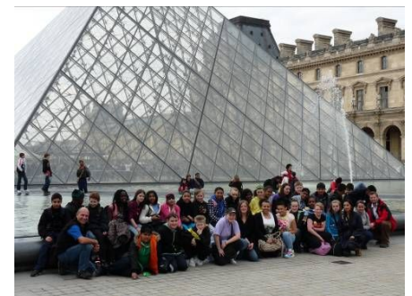
3 - Aspirational